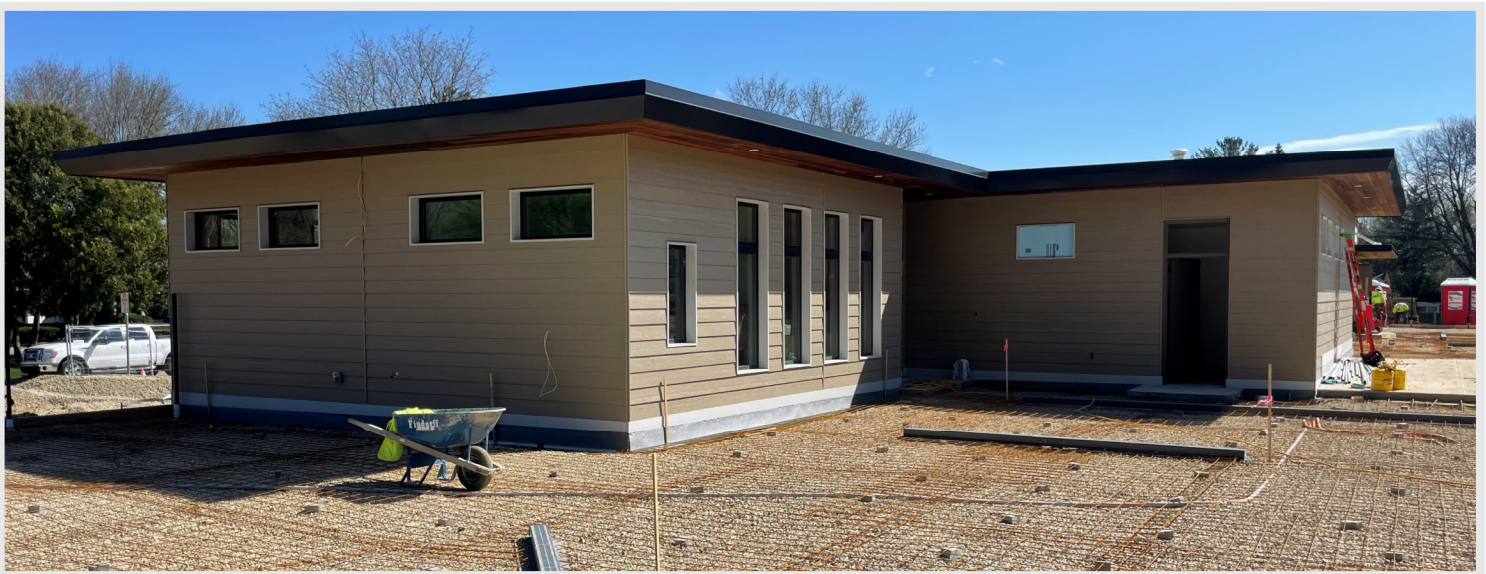
Above: A photo taken from the pool deck between the new lap and wading pools. Underground rough-ins and trench drain install is complete and the pool deck reinforcing is in place. Stay tuned for the next update as we should expect to see the pool decks completely poured out.