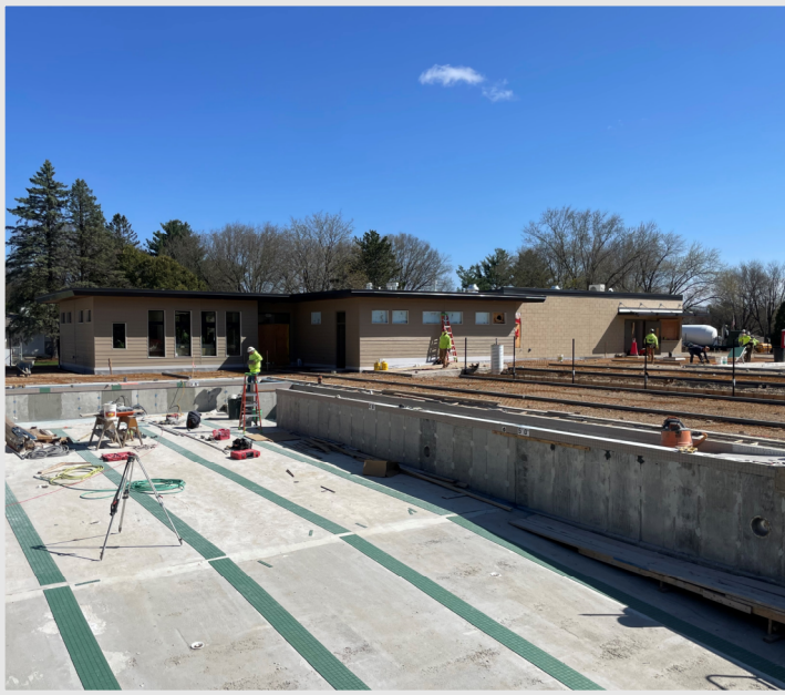
Above: Pool vessel tile is well underway. Once tile is complete, the pool vessels will be ready for a coat of plaster and the final pool fill!