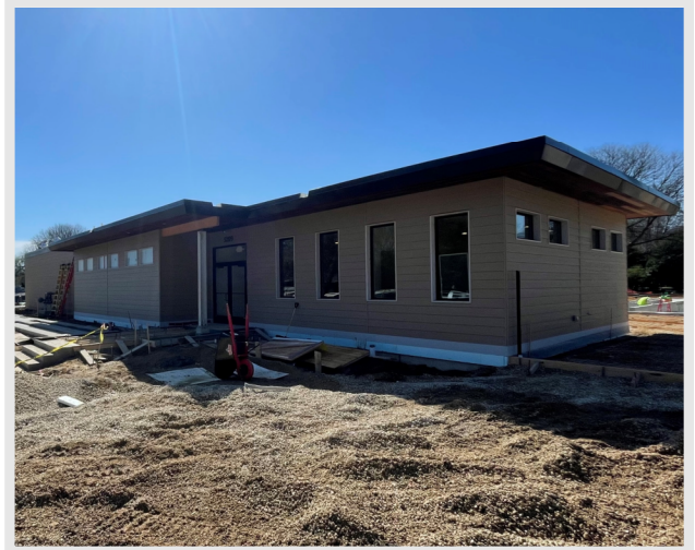
Above is a photo taken from the exterior of the main entry. Look closely and you can see the reclaimed lumber used at the soffit from the existing pool house!