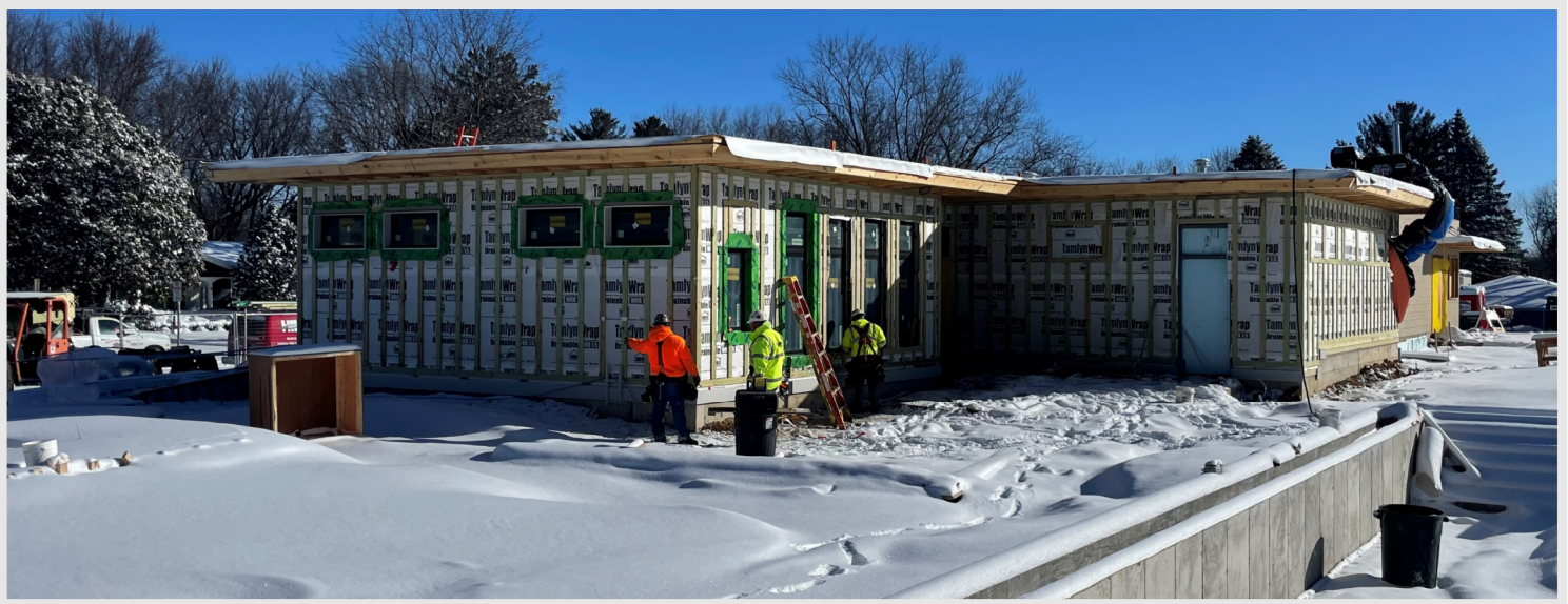
Above: A photo taken from the southwest corner of the pool house showing the building wrap, furring, and windows completely installed. Up next is the exterior window trim and siding!