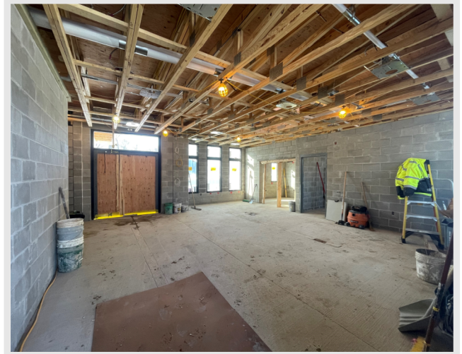
Above is a photo taken from the front entry of the new pool house. Soon the ceiling will be installed, walls painted, and cabinets set in place!