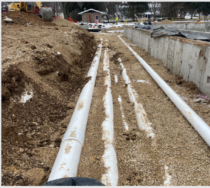
Above: Pool piping coming from the surge tank for the dive vessel and new competition/recreation pool is now complete and has been stubbed into the pool house for future connections.