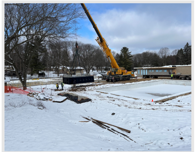
Below is a photo showing the first of the two surge tanks being set. This tank weighed almost 60,000 pounds!