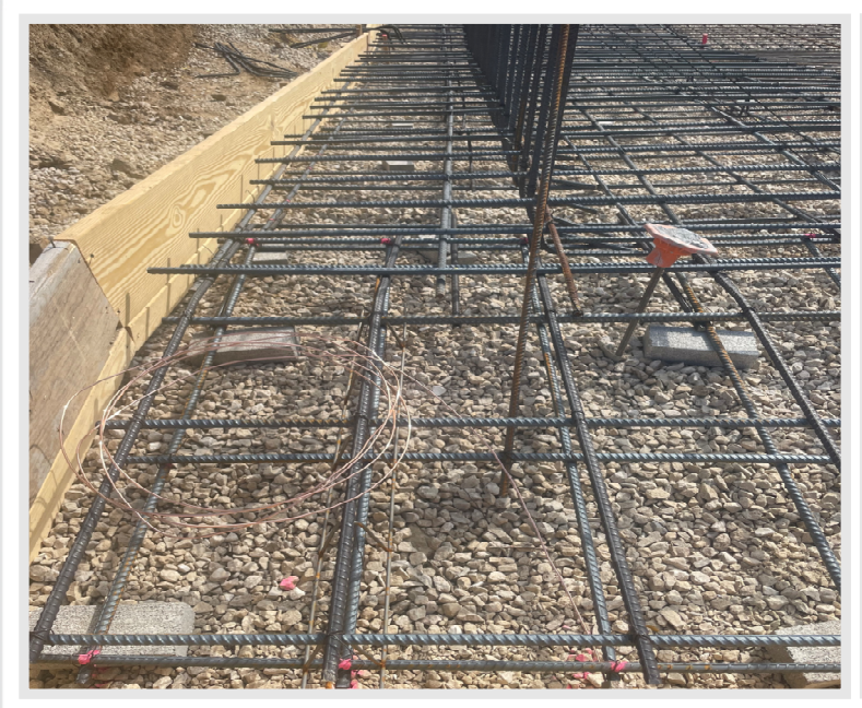
Above: A photo showing what the grounding, that was mentioned in the fun fact, looks like. Look closely for the wire and its connection to the rebar.

Million S109 Barton Rd • Madison, WI Million Million Million PAGE 2