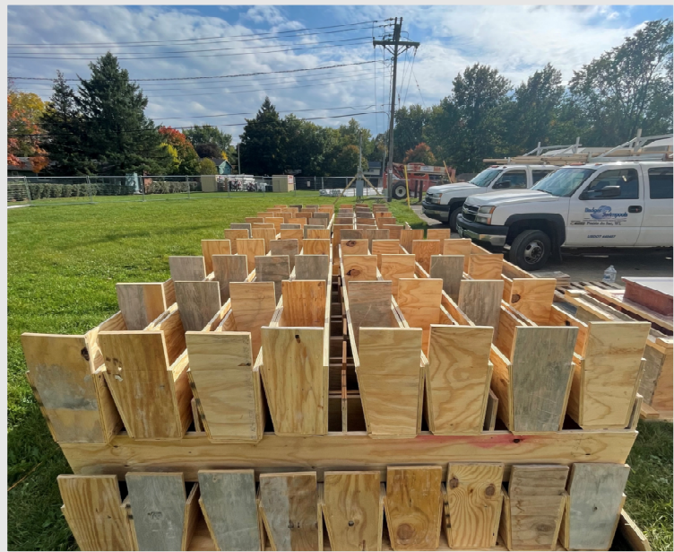
Above: Crews have already stared prefabbing the forms for the pool gutters that exist at the top of the pool walls. They'll prefab these forms to stay ahead and efficient when it comes time for the pour.