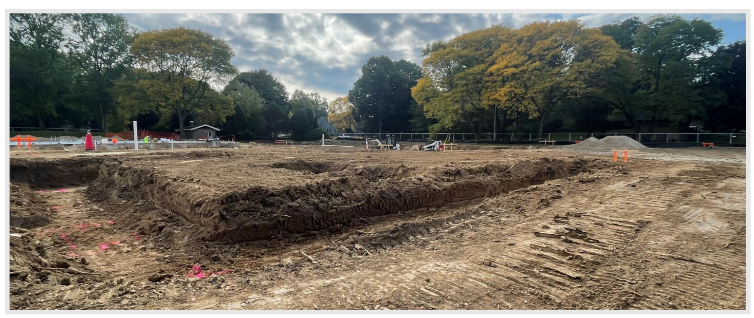
Above: A photo showing the start of the excavations for the new pool house. Footings and foundations will start next week!